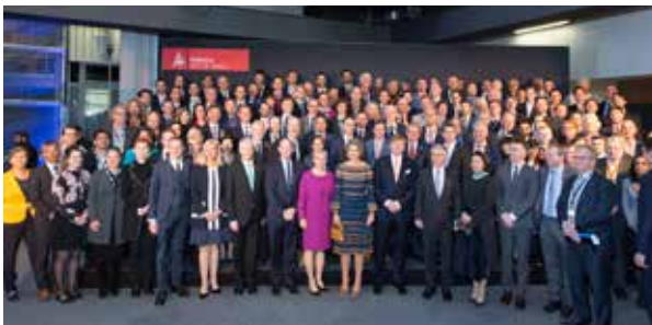
Trademission on space during a working visit of King Willem-Alexander and Queen Máxima to Bremen (March 2019).