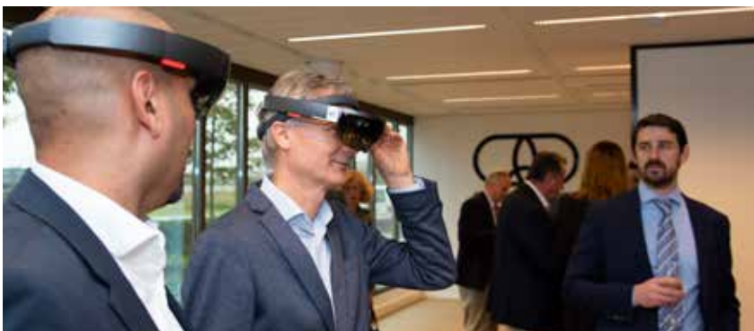
Opening SCN AVATAR, Dutch development centre for virtual and augmented reality tools and services for the space domain.

Costs associated with the implementation of projects and other cooperation activities as described under action line 3 have their own method of (co)financing. Depending on the type of activity, the appropriate method for co-financing is considered (eg Horizon Europe or ESA, Interreg, or other specific national or regional instruments).