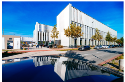
The ECOMAT research and technology centre: Bremen's contribution to the key technology of lightweight construction

of the Airbus aircraft, the Ariane upper stages and the satellite navigation system GALILEO. The ESA Business Incubation Centre (BIC) Northern Germany is the new flagship project for the aeronautics and space sector in Bremen. Our space incubator – part of the European Space Agency's (ESA) network of 29 centres across Europe – is set to take on startups from Bremen as well as from other federal states in Northern Germany.